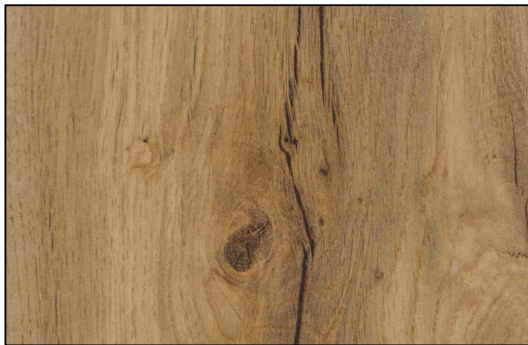
NEW (WW) WP 171 WOTAN EICHE

The same is Horizontal Directions is available in 4 Colour Patterns in which the granular direction is also horizontal perfectly matching the texture pattern.