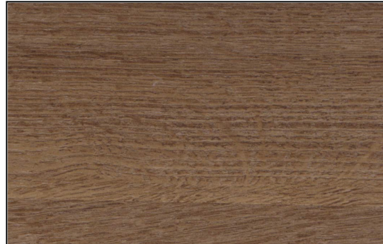
(WY) WP 166 YOKO AMBER LIGHT