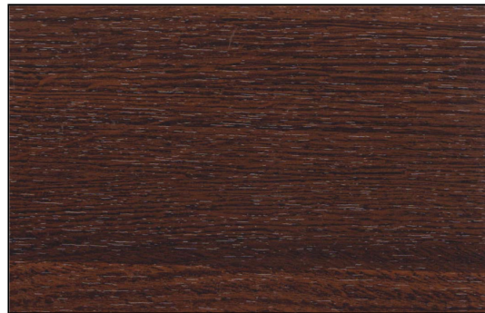
(WY) WP 165 YOKO AMBER DARK